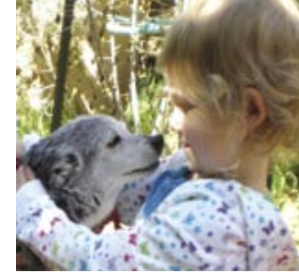
Sammy greets a young visitor to Kindred Spirits Animal Sanctuary.

First, there is a happy ending for Rusty, the "golden oldie" who spent more than a year with us. He has been reunited with the family that loved and raised him for the first 12 years of his life! The family was forced to give Rusty