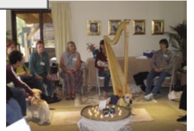
Participants enjoyed beautiful harp music and candlelight at the End of Life Care Workshop.

Another dramatic story took place in late November. One of our volunteers was feeding poultry early one morning, when a bobcat ran past her! She soon made a gruesome discovery. The bobcat had killed 15 birds including a variety of chickens, a peacock and eleven ducks. We took immediate steps to keep the remaining birds safe,