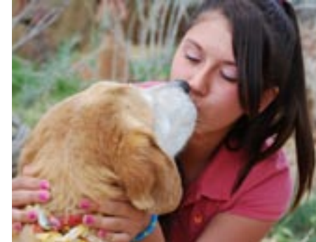
Rusty reuniting with his family

Kindred Spirits is dedicated to providing life-long care of older, unwanted dogs, horses and poultry in a sanctuary setting. In addition, our educational programs focus on the beauty of animals as teachers of unconditional love. We believe this facilitates a better understanding and appreciation of our individual and collective aging processes where we feel privileged to return this love and care to these most vulnerable members in our community.